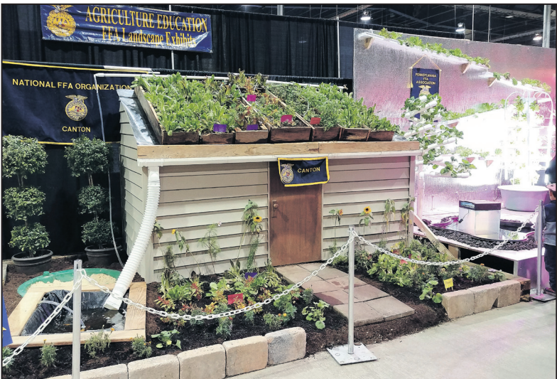
Canton FFA's landscape display entry.

While attending the 102nd Farm Show, thousands of people were able to see a variety of projects on display, produced by FFA members. Projects on display included display booths, landscape designs, horticultural exhibits, tractor restorations and agriscience fair displays. Projects ranged from an experiment on worms to a display on the world's carbon footprint. Each one of these projects gave FFA members the chance to learn new skills in their respective field such as laying out a landscaping plan to forming a hypothesis for a research project. The variety of projects on display were a true testament to the theme of this year's Farm Show, "Strength in our Diversity." Giving students a wide variety of opportunities is something that FFA strives to achieve. Members of Pennsylvania FFA are able to explore their in-