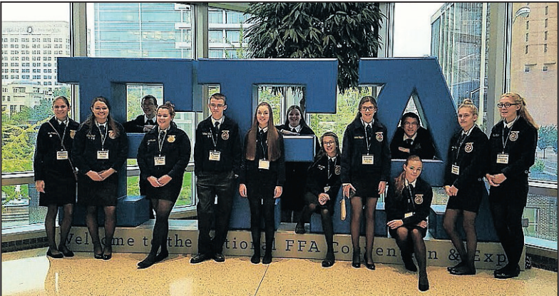
Battlefield FFA members pose at the National FFA Convention.