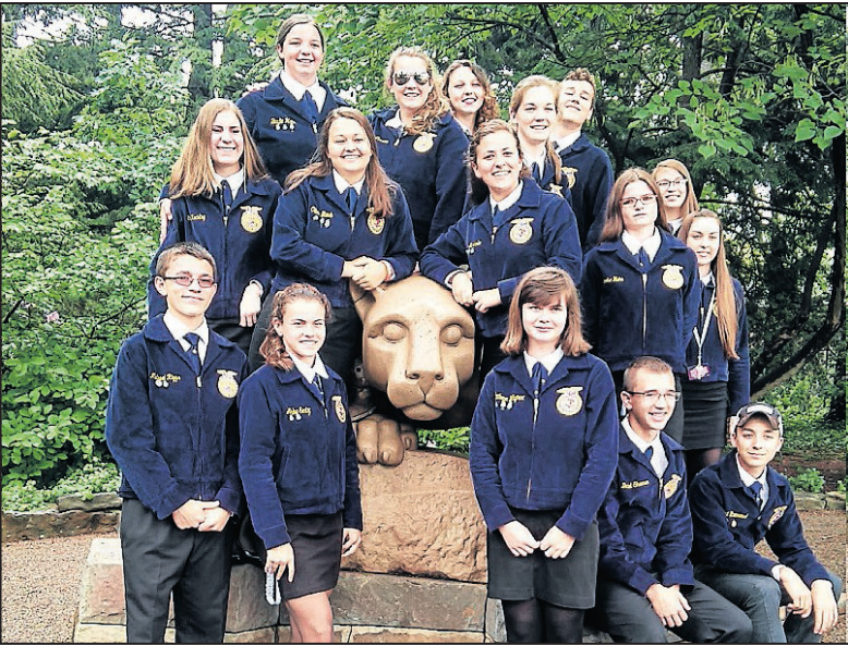
Battlefield FFA members gather around the Nittany Lion at last year's state competition.