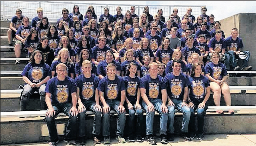
FFA members attended the Western Pennsylvania FFA Leadership conference June 29-30.