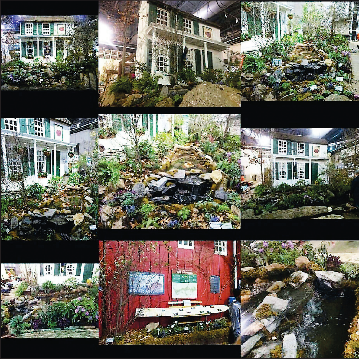
Submitted photos A collage of the award-winning display at the Philadelphia Flower Show organized by the W.B. Saul High School horticulture class.