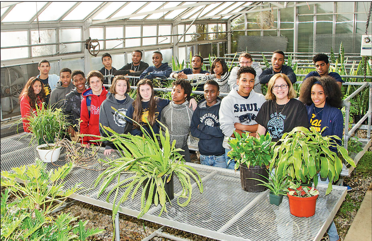
Members of the horticulture class.

time after school and on the weekends. With the help of more than 70 students and 15 staff members, the exhibit came out better than anyone could have imagined it would be. Competing against other colleges and one high school, the students were able to win a Gold Medal Education award as well as an Environmental Award at the Flower Show. Editor’s note: To view the class’ Flower Show website go to http://saul2016flowershow.weebly.com/ .