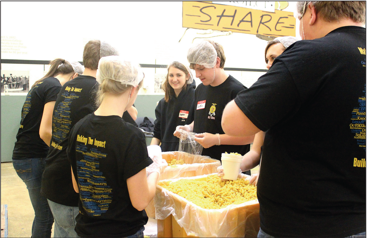
FFA members performed community service at more than 16 locations throughout the Harrisburg area as part of the conference.