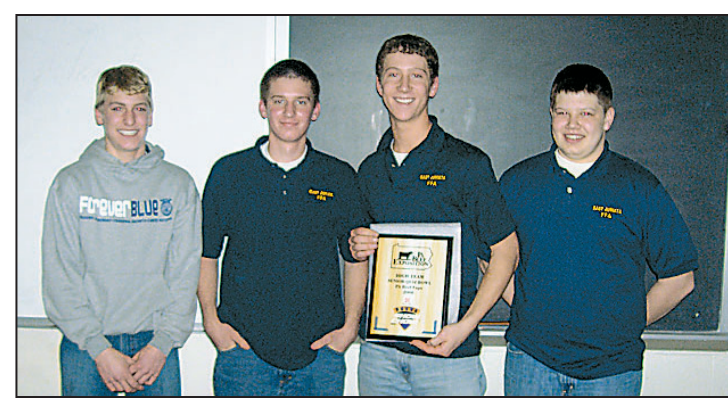
East Juniata FFA members were proud to bring home the winning plaque from the Pennsylvania Bull Test Sale Quiz Bowl.