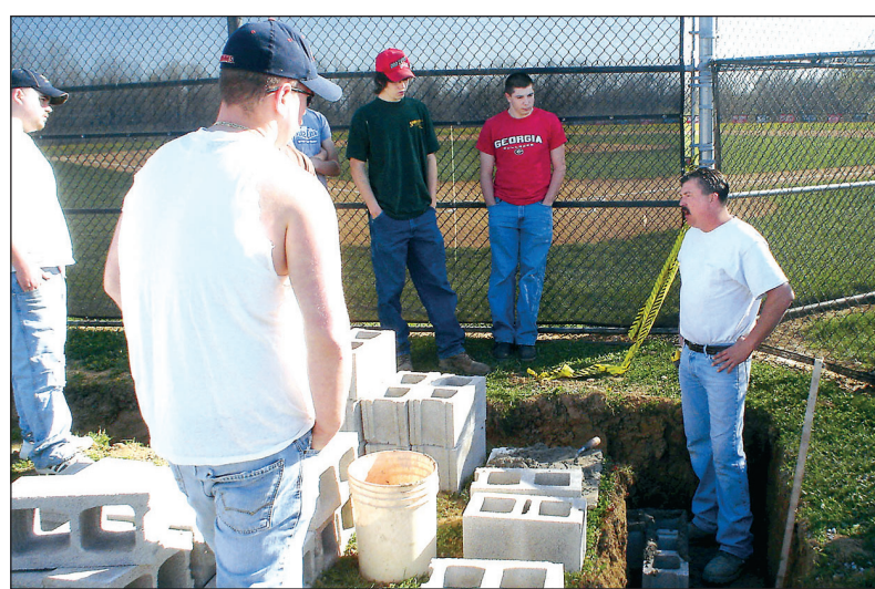
Students lay block for the baseball building.

Cat in action. A Tool Cat is a multi purpose machine the can operate many different attachments that skid loaders use. The Tool Cat was articulated so it would not rip up the sod like a skid loader would. The machine demonstrated a trencher to cut the ditches for the conduit and bucket and brush attachments that were used to complete the project. After local electricians pulled the wire through the underground conduit, the Ag classes continued work on the building. The students laid out the electrical system for the building and installed all the wire, surface conduit, and electrical fixtures. The students gained experience with stranded wire for conduit, fishing wire through the conduit and connecting all of the ground fault circuit indicator (GFCI) receptacles. The lighting fixtures used standard solid Romex