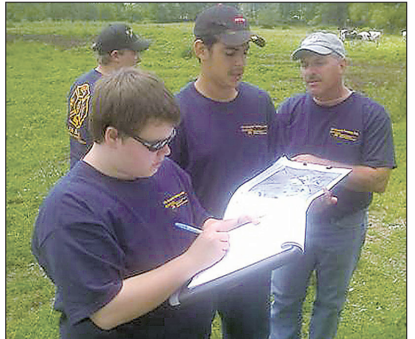
FFA members work with a Centre County farmer to map his farm during the FFA SAFE Mapping Camp.

In order to properly train FFA members from around the state, Penn State University and the FFA teamed up to offer two Farm-Mapping camps in June. Students from Upper Dauphin, to Bermudian Springs, to Canton, to Walter Biddle Saul, to Northern Potter FFA and many other chapters were all participants of this camp and are now prepared to map local farms. In fact, 17 farms in the State College area were mapped during these two camps and a hand-full of other farms have been mapped since the camps. The long term goal for this program is to train teachers as well as FFA members so that the teachers can use this program in their regular curriculum every year and continue to map more and more of Pennsylvania's more